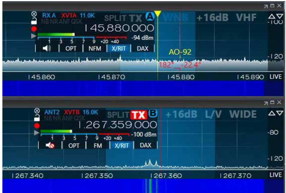
Figure 4 — FlexRadio SmartSDR Slice Flags showing frequencies and modes.

XVTR band L/v definition, the association of the TX3 PTT connector with the L/v mode, and the SatPC32 Doppler.SQF L/v mode definition of the uplink and downlink frequencies for the satellite AO-92. These slice pictures were recorded with SatPC32 and FlexSATPC controlling the satellite system.