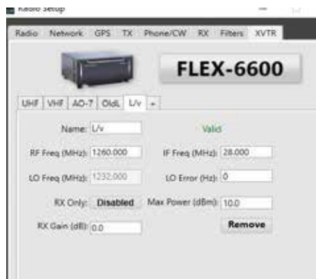
Figure 3 — FlexRadio SmartSDR XVTR definition for L/v mode.

The receive and transmit slice flags in SmartSDR are shown in Figure 4 using the