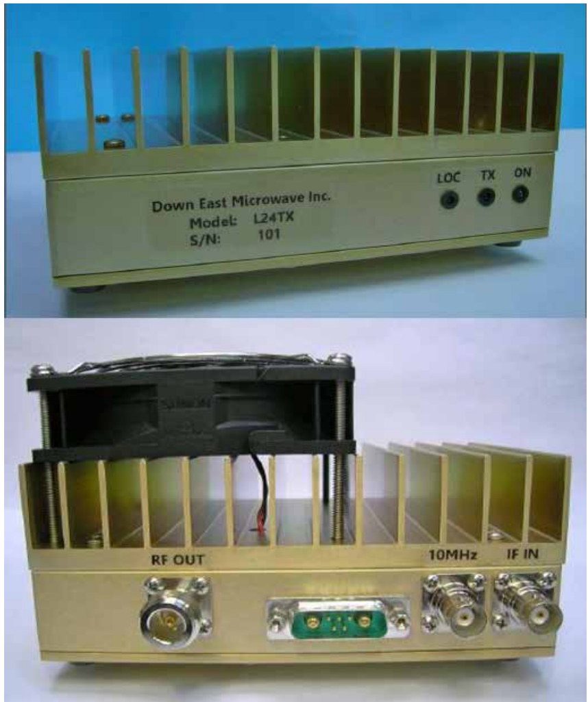
Figure 1 — DEMI 24 cm Transmit Converter.

The Down East Microwave 24 cm Transmit Converter, Model L24TX, is a highly configurable transmit-only product with up to 25 W output between 1260-1270 MHz designed specifically for the Amateur Radio satellite service. See Figure 1. It has options that enable the use of selectable IF frequency ranges and drive levels to work with an existing satellite system or a newly designed set-up. The converter takes a 10 MHz user-selectable range and up-converts it to the 23 cm worldwide satellite sub-band at 1260 MHz. Frequency accuracy is obtained with an on-board synthesizer locked to an external standard 10 MHz source. There are options for various drive levels from -20 dBm to 10 W and for transceivers that do not have continuous 10 MHz wide output at 10 m and 6 m. The output power can be monitored by a reference voltage available through an auxiliary connector.