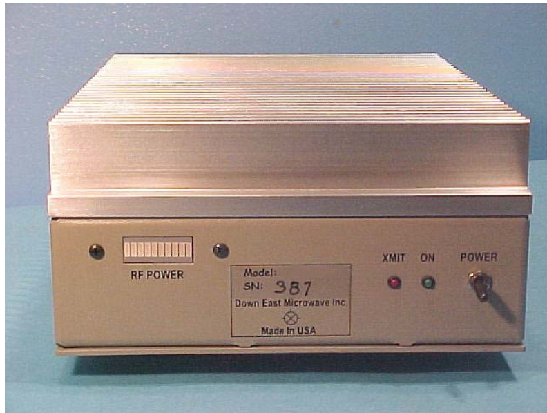
902/3-144 & 902-28 Front