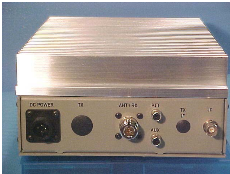
902/3-144 & 902-28 Back

Above model configured w/ optional common IF and common RF options installed.