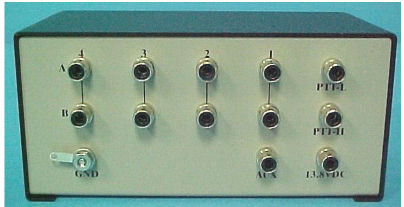
TRS Back View